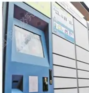
E-self service Locker