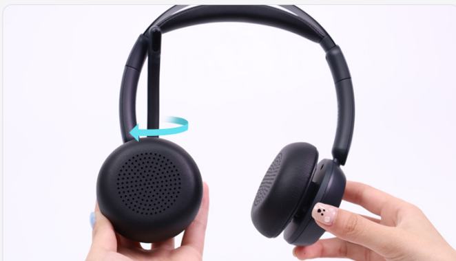
180° rotatable ear muffs

Minimize pressure on ears and head, catering to various head sizes