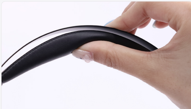
Soft padded leather sling